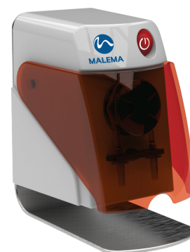
MDP-7777 with Plastic housing

The Malema Micro Dosing Pump is available as a standalone unit with programmable LCD display (as shown), or as a pump-head module with controller pcb and software for OEM developers.